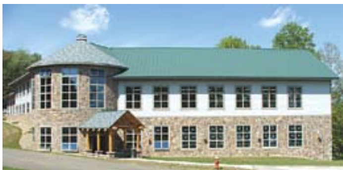
Energy saving technology is used in the new Dental Ceramics building.

Mitchell said that the building has three levels with a total of 26,250 square feet. The exterior siding meets a base of natural fieldstone. Inside, timber frame